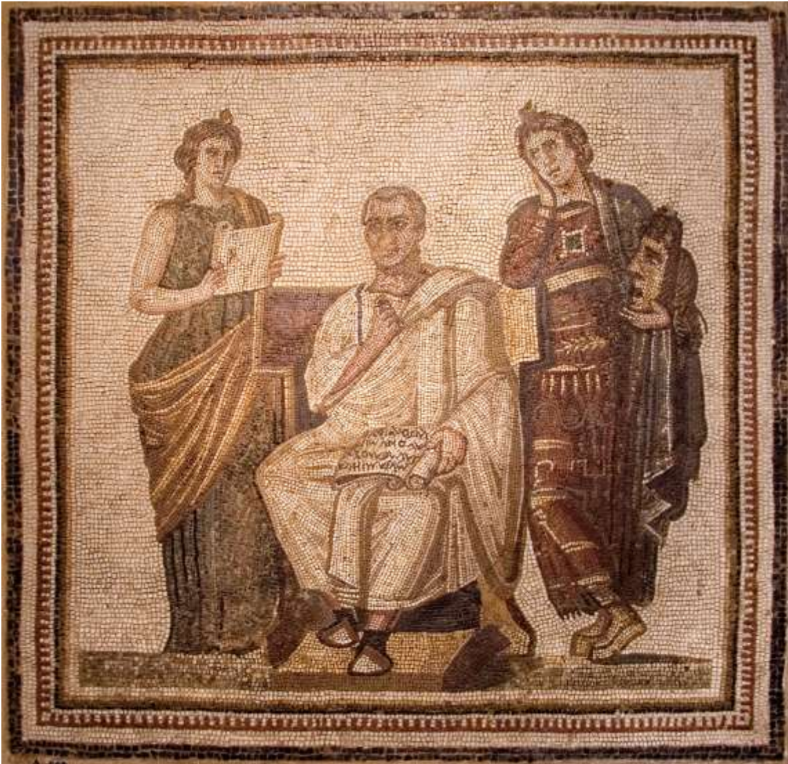
Mosaic of Vergil, with a volumen of the AENEID on his lap, flanked by two Muses. Bardo National Museum, Tunisia

questions, are available. If you believe you may be interested, email me at lafleur922@hotmail.com for further information.